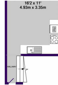
GROUND FLOOR APPROX. FLOOR AREA 165 SQ.FT. (15.3 SQ.M)