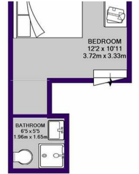
1ST FLOOR APPROX. FLOOR AREA 185 SQ.FT. (17.3 SQ.M)