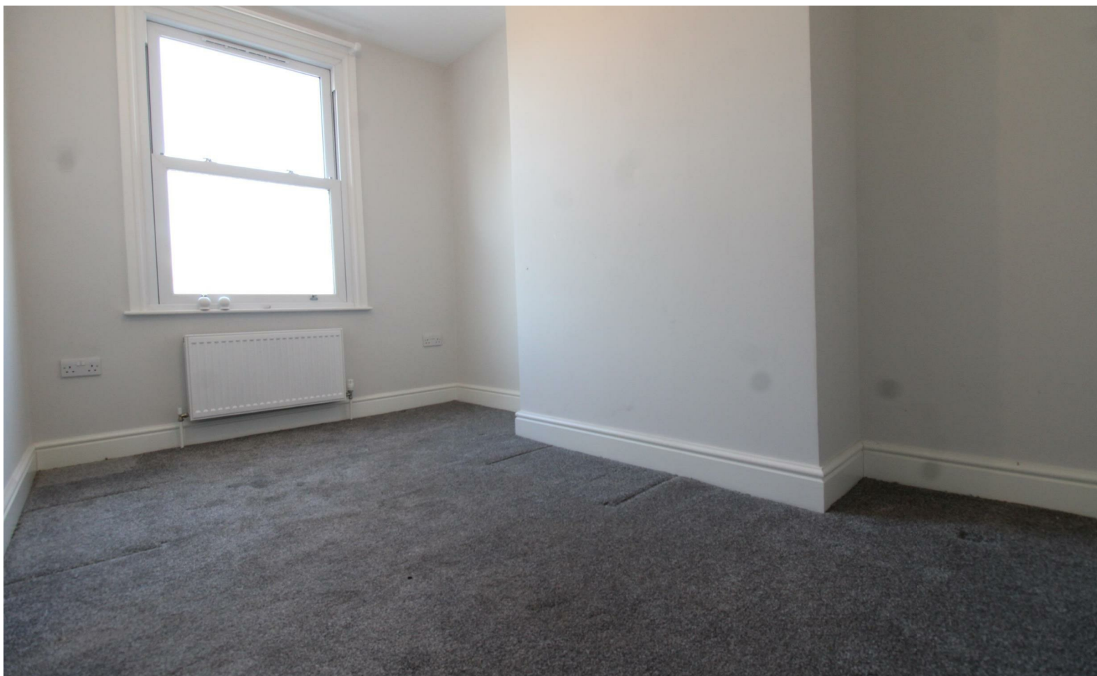
Bedroom 3 12'10" x 6'3" (3.93m x 1.93m)