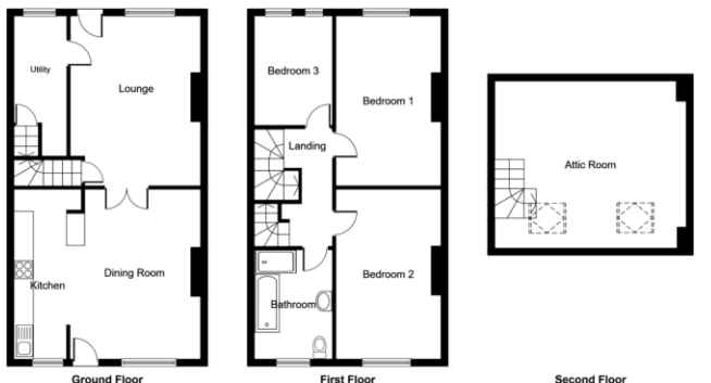
8 Vine Terrace, Thornton, Bradford, BD13 3NE. NOT TO SCALE For layout guidance only

11 Green End Clayton Bradford West Yorkshire BD14 6BA