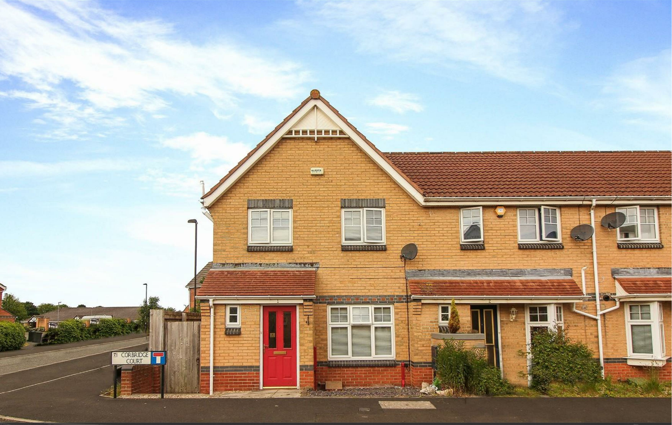
📍 Corbridge Court, Newcastle Upon Tyne NE12 8UY