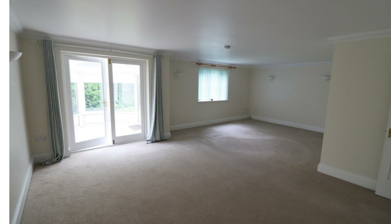
DAVID PENHALIGON WAY, TRURO £795 PCM