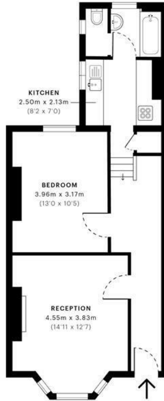
— Raised Ground Floor