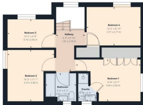
1st Floor Building 1