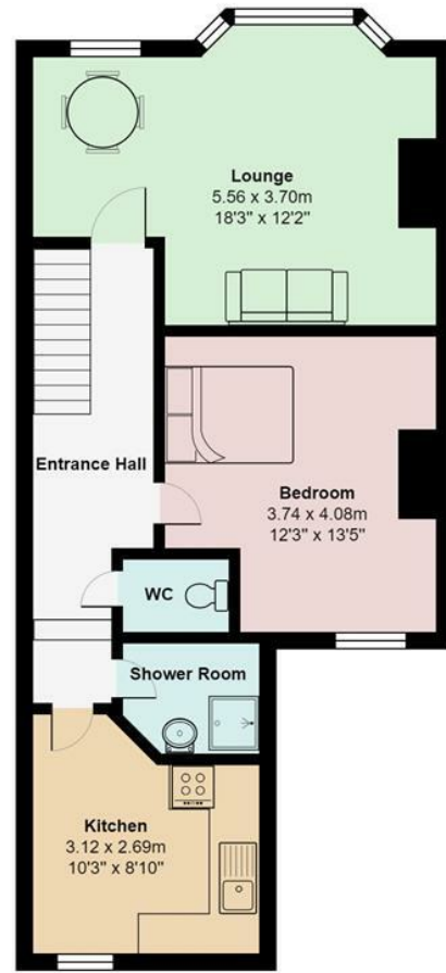
Flat B Newfoundland

1 Bedrooms - Cardiff - CF14 3LD - £650 Per Month