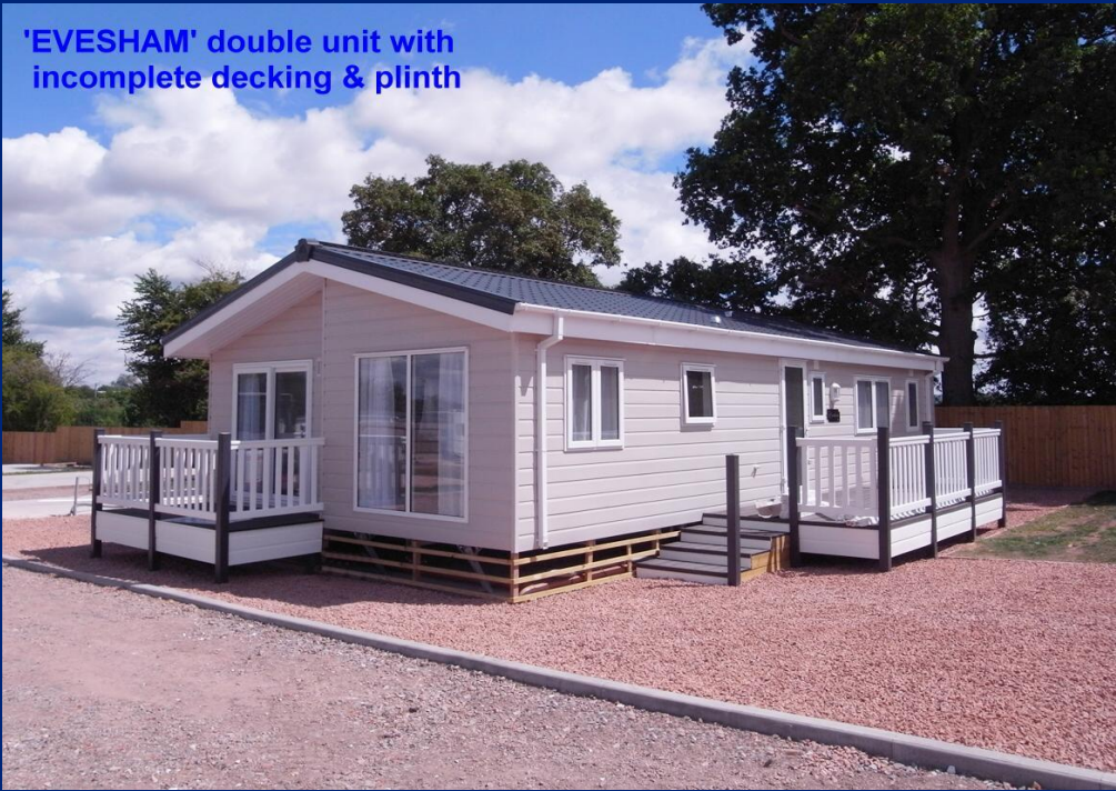
'EVESHAM' double unit with incomplete decking & plinth