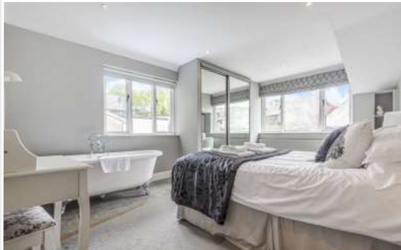
Bedroom 2 - Cardus