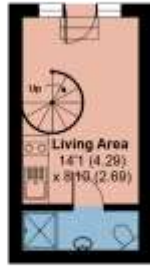
LITTLE HOUSE GROUND FLOOR