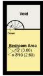
LITTLE HOUSE FIRST FLOOR