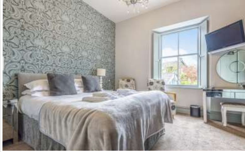
Bedroom 1 - Barnes

Services: Currently mains water and electricity is via The Boundary. The property has its own drainage.