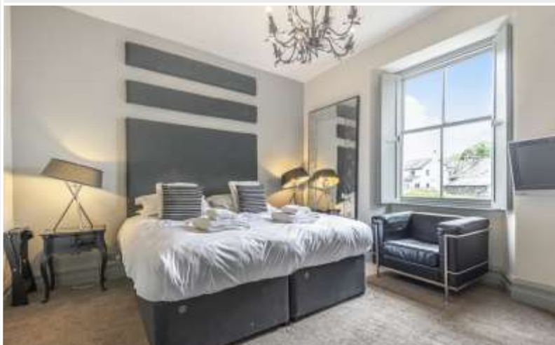
Bedroom 4- MacLaren