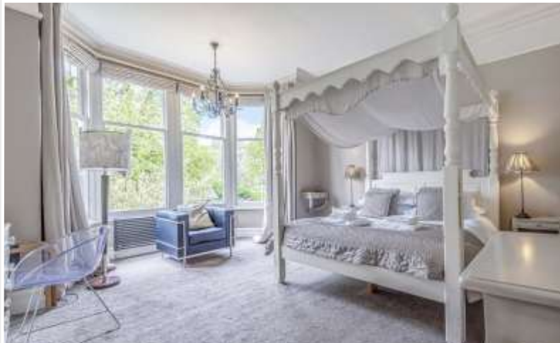
Bedroom 3 - Hobbs