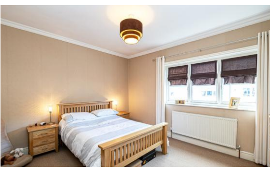
Dundonald Avenue, Stockton Heath