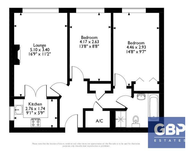
Myddleton Court, Flat 25, 2A, Clydesdale Road, Hornchurch Approximate Gross Internal Area 65 Sq M/697 Sq Ft