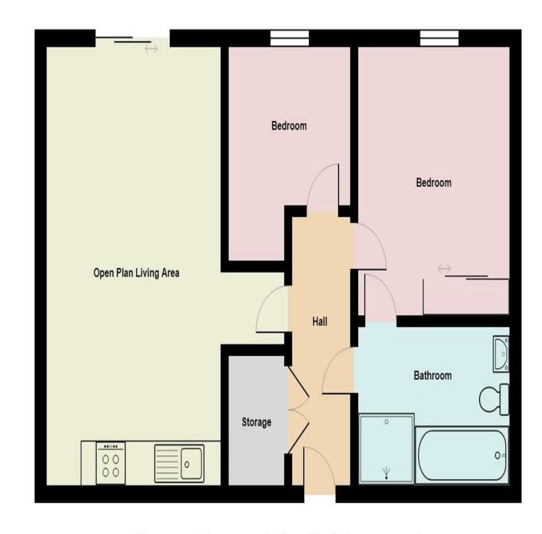
All measurements are approximate and for display purposes only

Martin & Co Newcastle under Lyme 57 Merrial Street • Newcastle under Lyme • ST5 2AE ... 01782 453 001 T: 01782 453 001 • E: new castle underlyme@martintottom/www.martinco.com