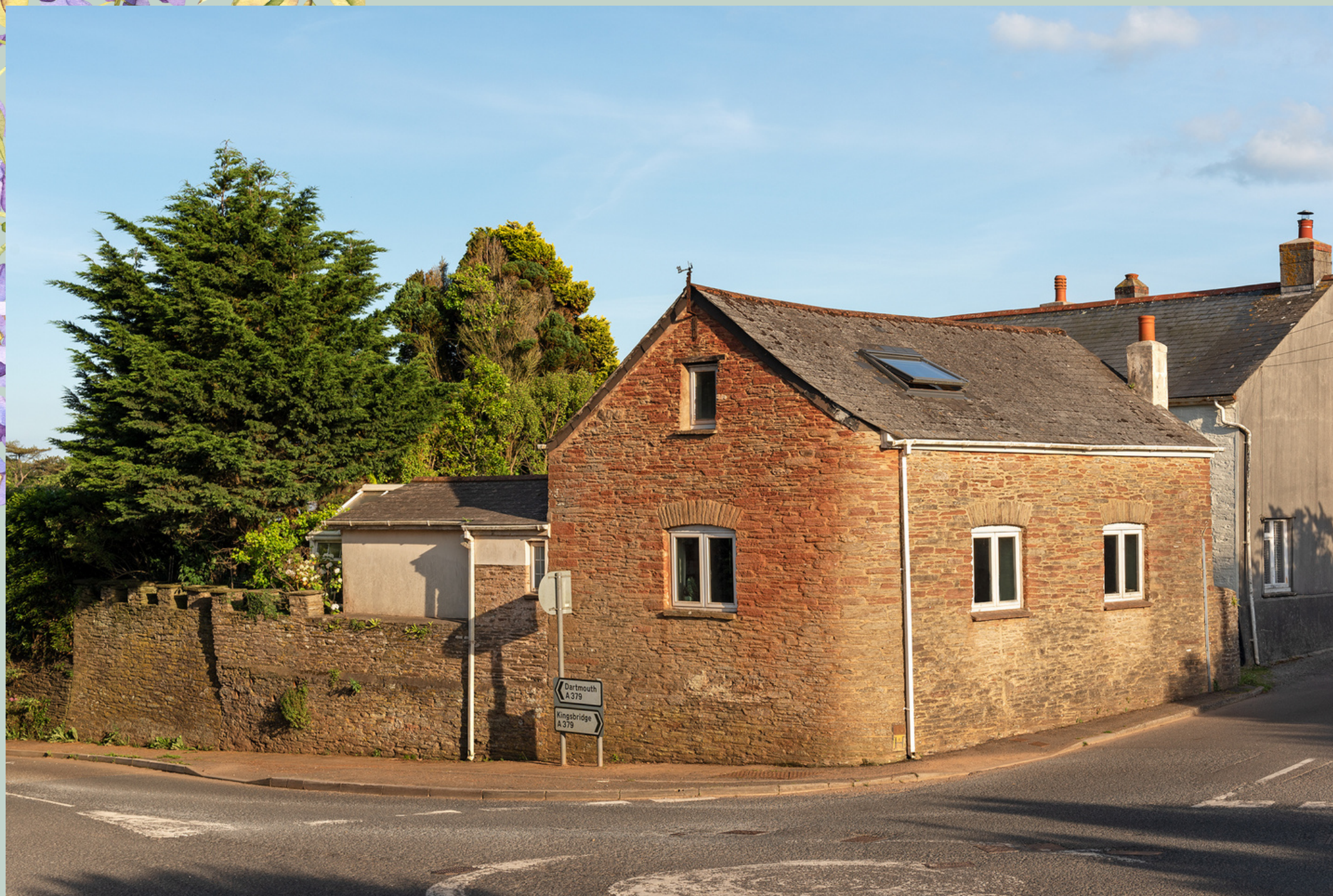
Monks Rest Cottage Stokenham