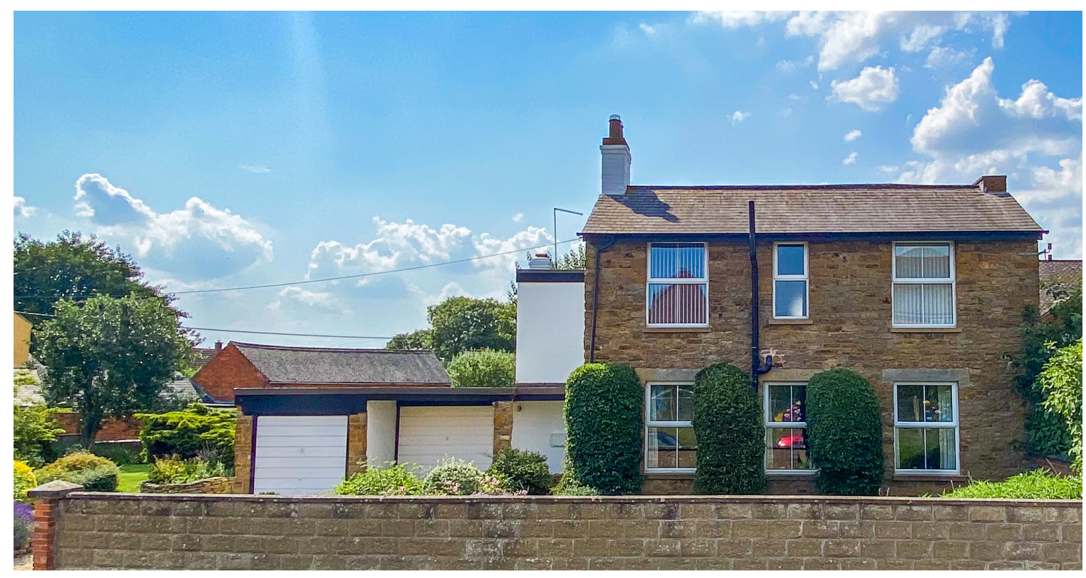
4 Bedrooms | 2 Bathrooms | 3 Reception Rooms | Single Garage