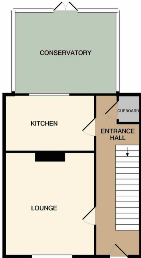
GROUND FLOOR APPROX. FLOOR AREA 587 SQ.FT. (54.5 SQ.M.)