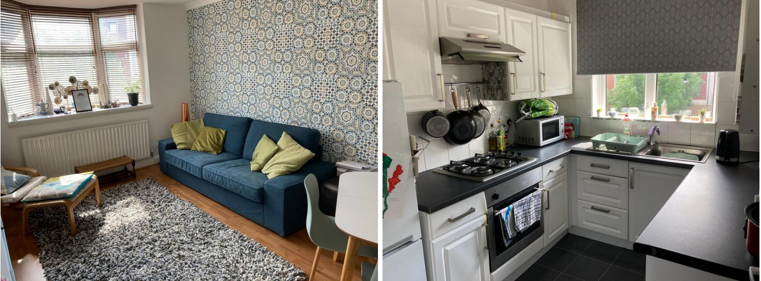
16a Butter Hill, Wallington, Surrey, SM6 7JD | £275,000

Paul Graham are pleased to market this well presented and spacious 2 bedroom split level flat. Benefitting from its own entrance on the ground floor. The first floor has a lounge/diner, kitchen, bathroom and a double bedroom. Stairs up to the 2nd floor which has another double bedroom with an en-suite shower room. The property also come with a share of freehold and a garage. Offered with no chain. Viewing is recommended.