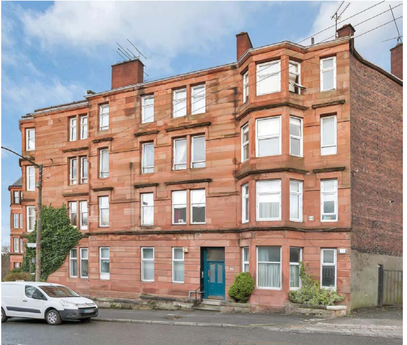
2nd Floor Red Sandstone Tenement Flat 2/1, 120 Shakespeare Street, North Kelvinside, Glasgow G20 8LF