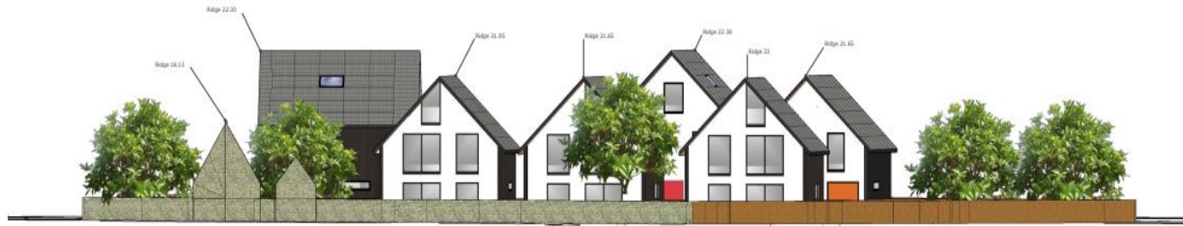
View from West

Agent's Note: NB on Google street view images an electricity pylon and wires are visible adjacent to the plot. Please note, these have been removed as part of the National Grid Hinkley Point Connection Project - for further details please see https://hinkleyconnection.co.uk/national-grid-begins-removal-of-pylons