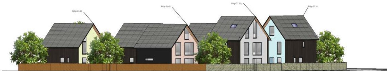
View From East