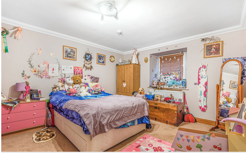
Owners Bedroom 2

Outside: External utility room, garage, parking for guests to the front and side and owners gated parking to the rear. Lawn and patio area, shed and garage.