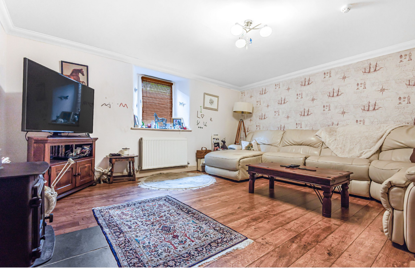
Owners Sitting Room

Living Room 15' 1" x 14' 7" (4.6m x 4.44m) With wood burning stove.