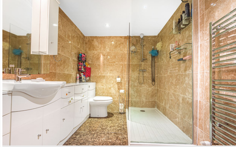
Owners Shower Room