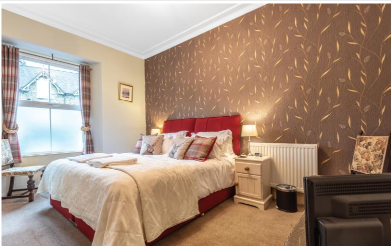
Letting Room 5