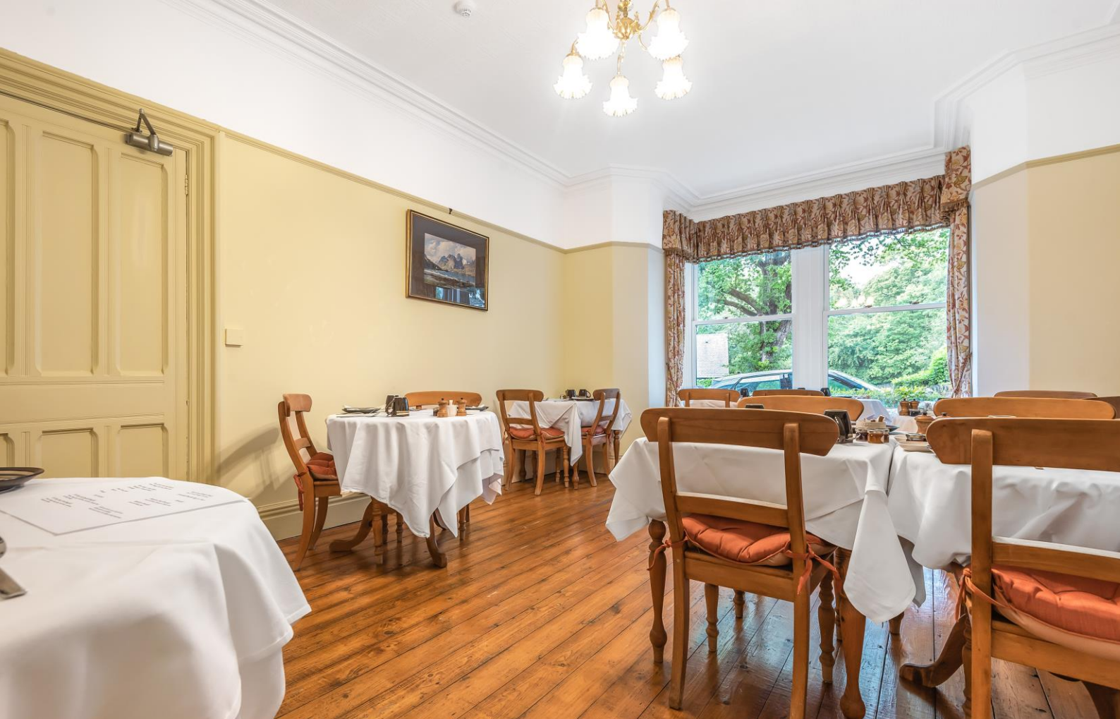
Guest Dining Room

Letting Room 1 13' 11" x 11' 11" inc en-suite (4.24m x 3.63m) With built in cupboard and en-suite containing shower cubicle, ladder towel rail, wash basin, ladder heated towel rail, part tiled walls and WC.