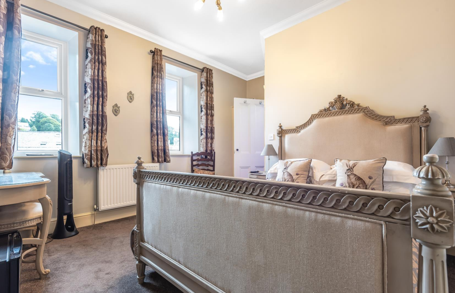
Letting Room 7