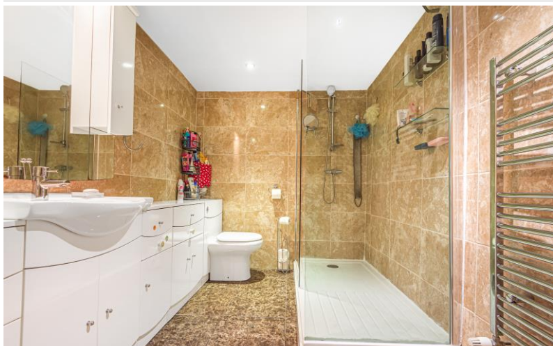
Owners Shower Room