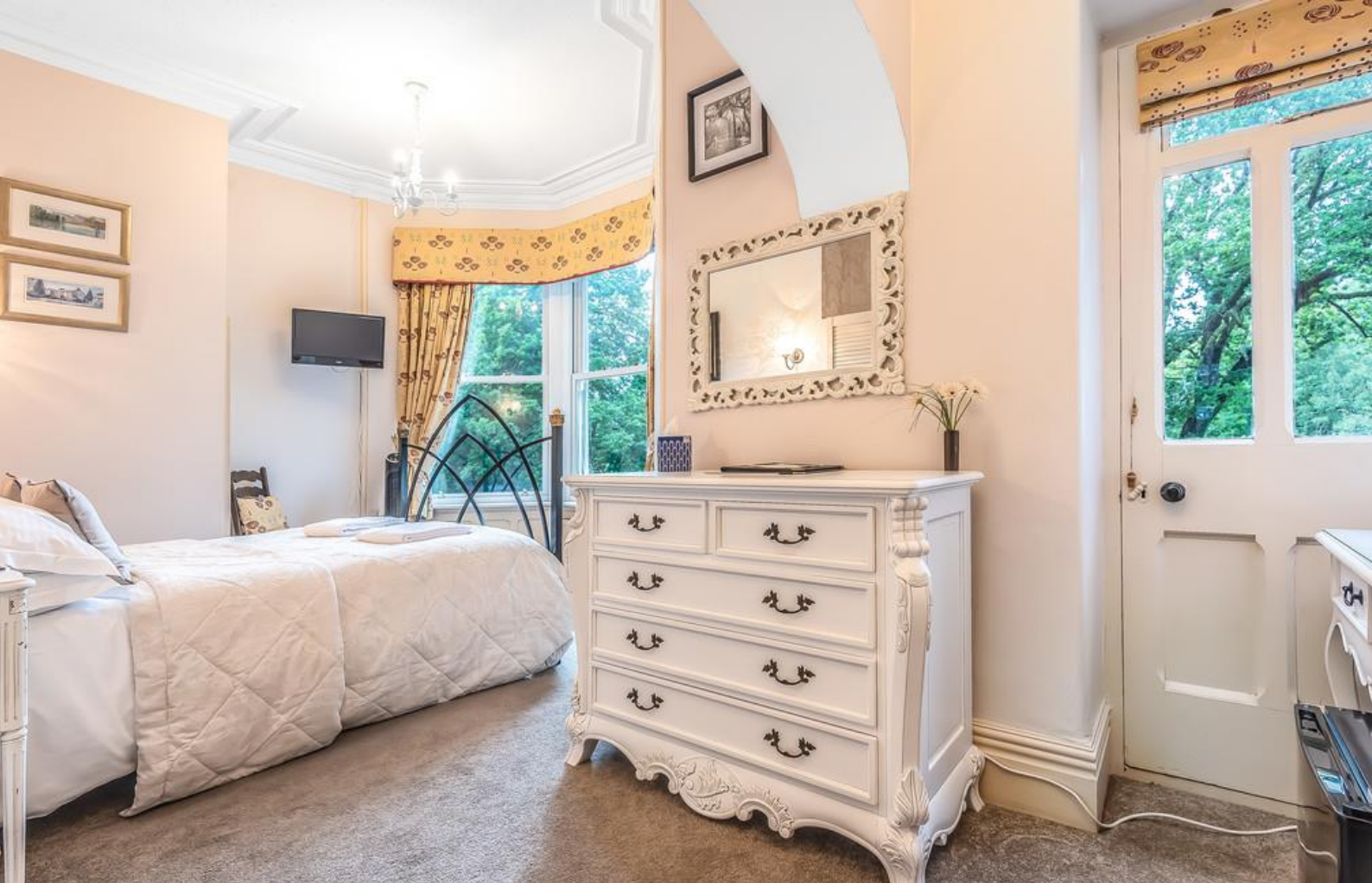
Letting Room 3