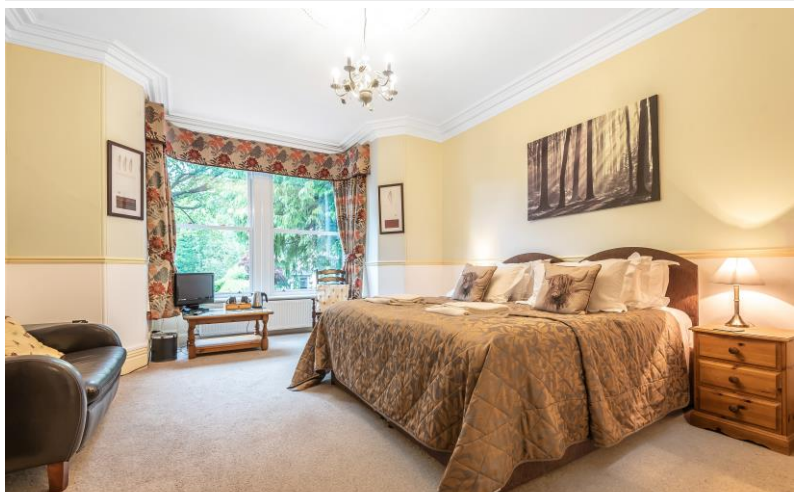
Letting Room 4