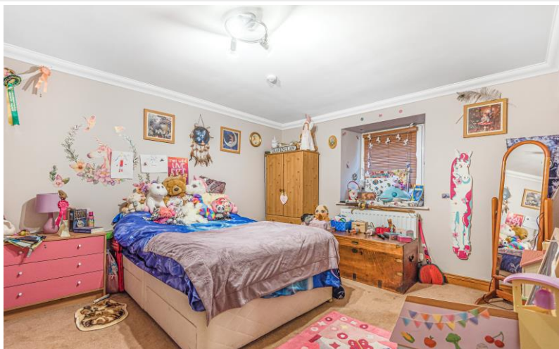
Owners Bedroom 2

Outside: External utility room, garage, parking for guests to the front and side and owners gated parking to the rear. Lawn and patio area, shed and garage.