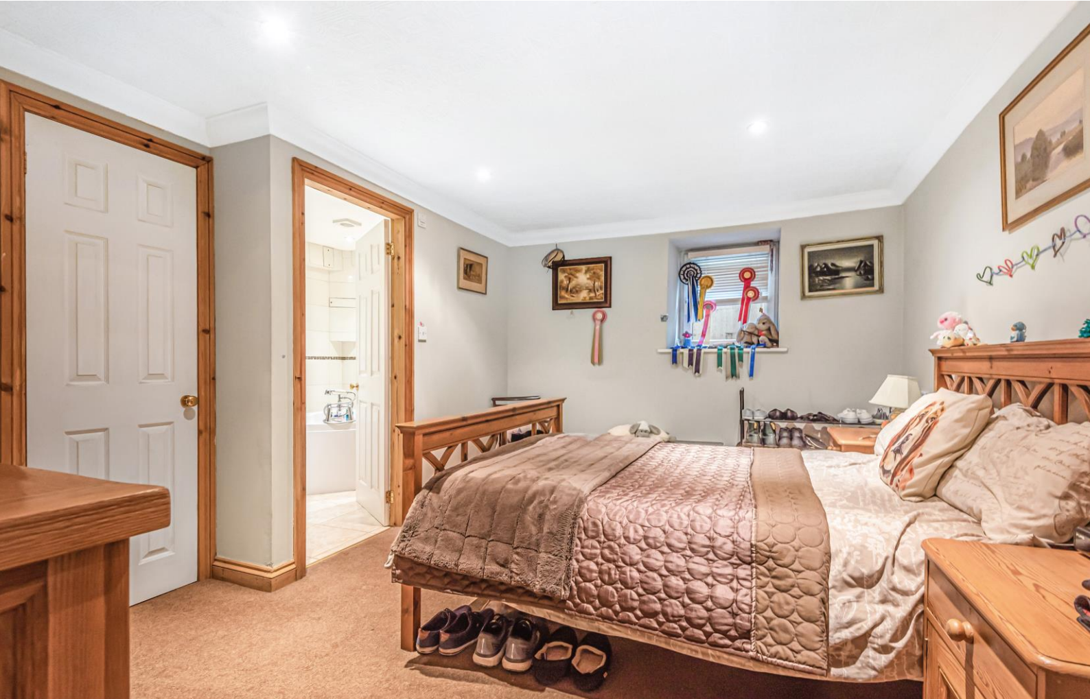
Owners Bedroom 1