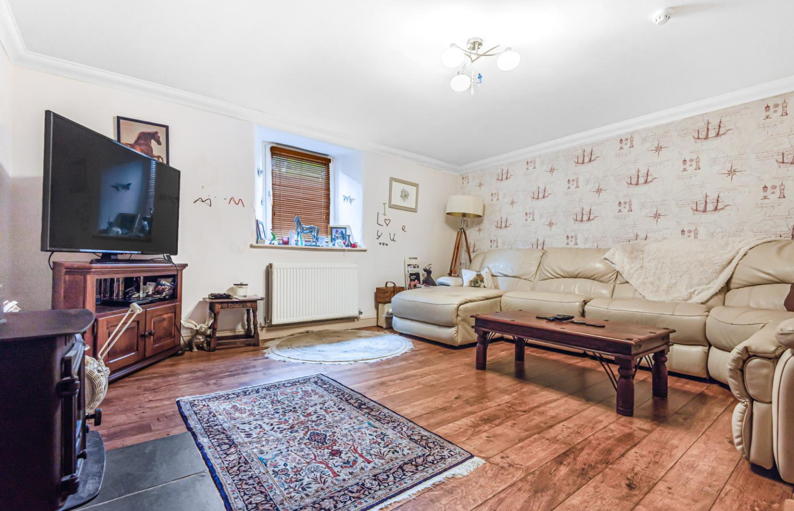
Owners Sitting Room

Living Room 15' 1" x 14' 7" (4.6m x 4.44m) With wood burning stove.