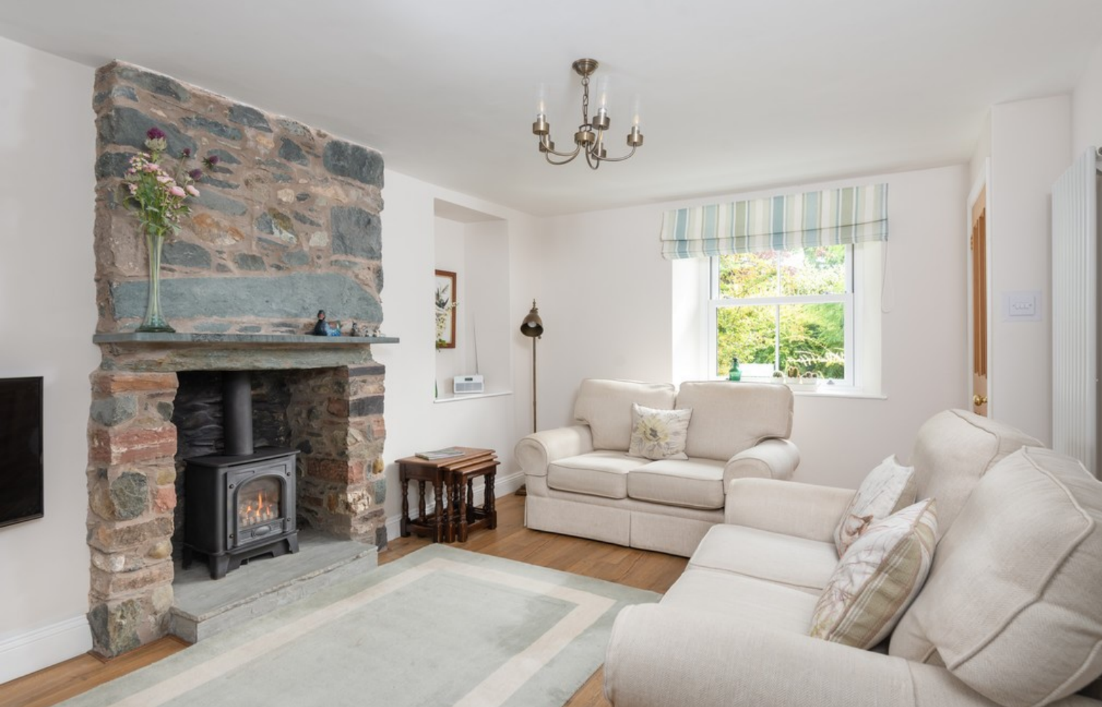
Living Room/Dining Kitchen

Business Rates Small business rates relief applies.