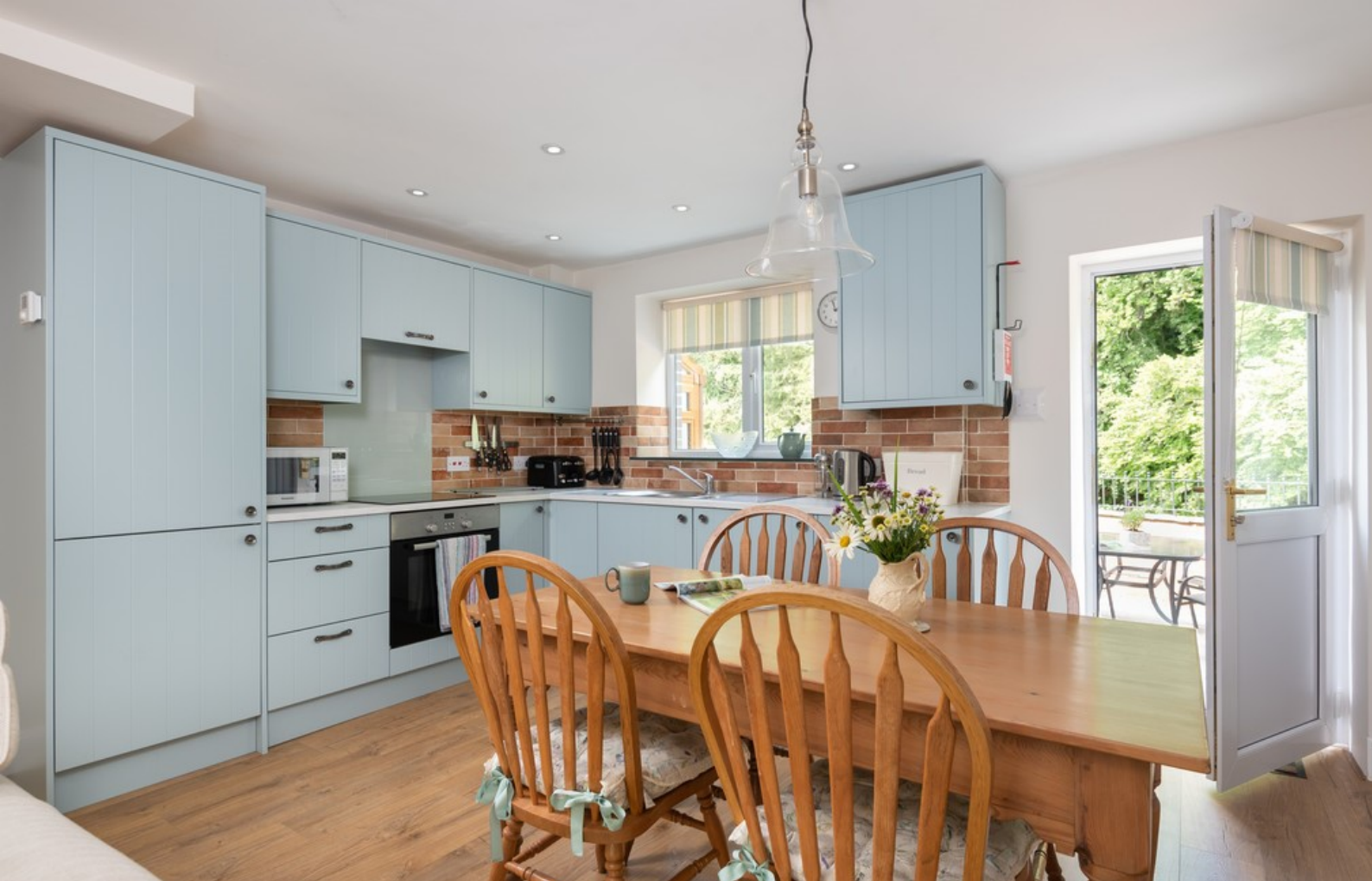
Living Room/Dining Kitchen