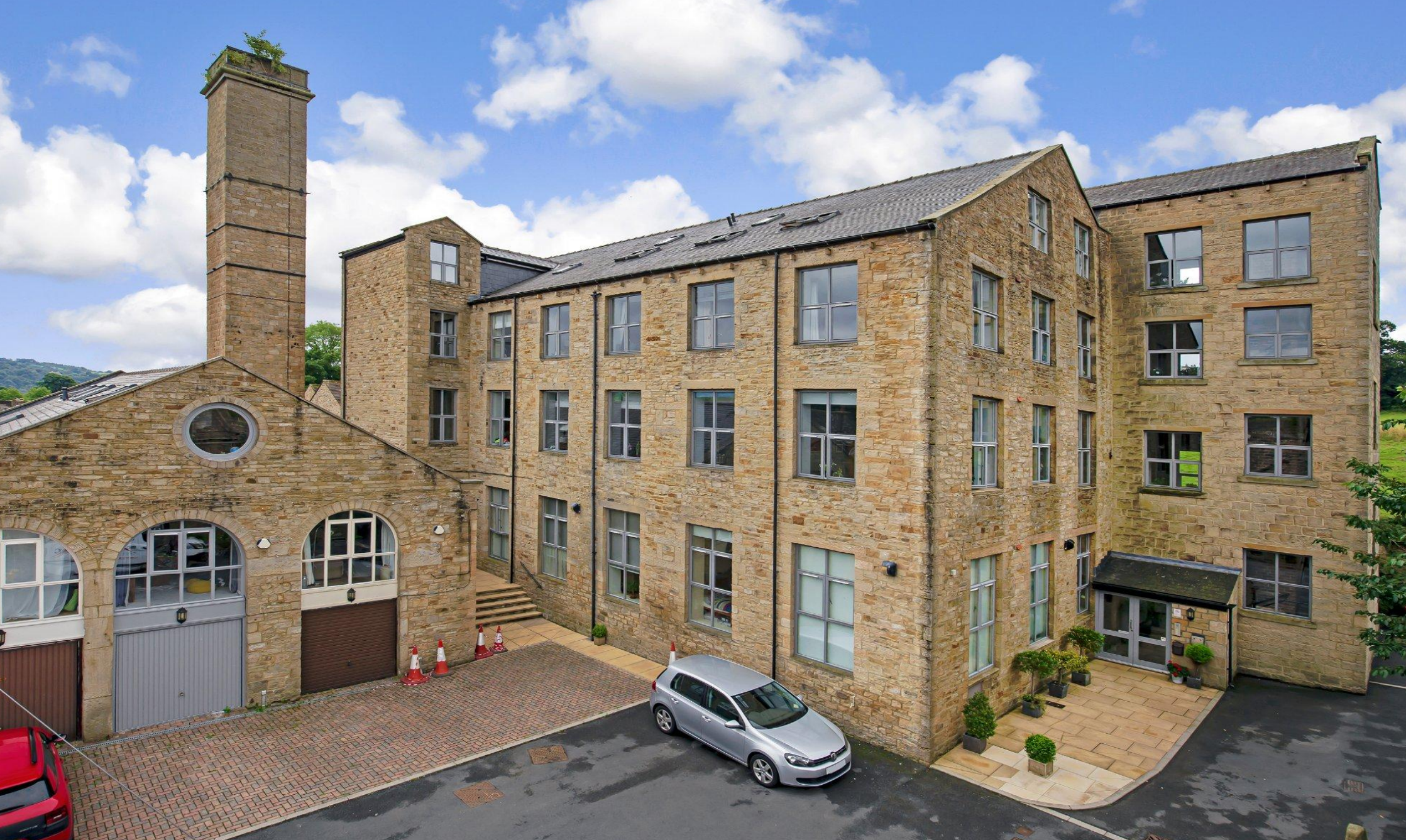
Burnside Mill, Addingham Asking Price Of £279,950