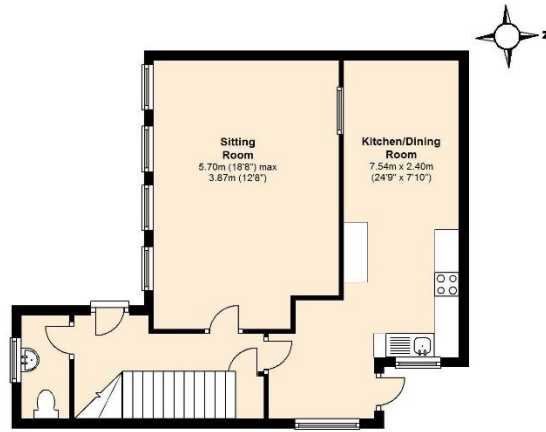
Ground Floor Approx. 49.9 sq. metres (537.2 sq. feet)