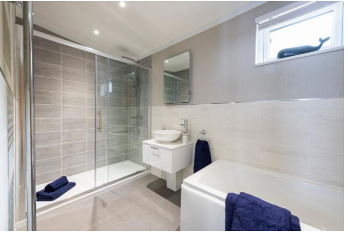
Please note: Stock images have been used, the home on site may vary.