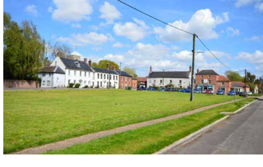
East Rudham village green