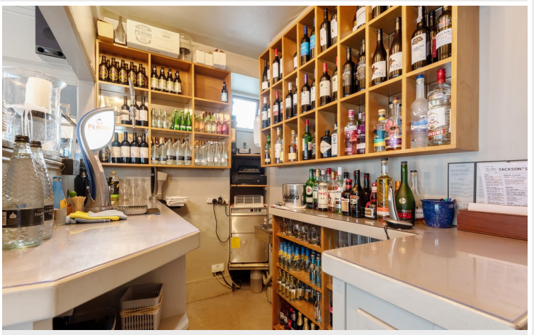
Open plan bar/servery

Description: The inside is charming and modern with additional characterful seating at lower level having beamed ceilings and flagged floor together with original fittings, providing an excellent dining experience. The business trades on evening dining only providing a healthy turnover with excellent profits.