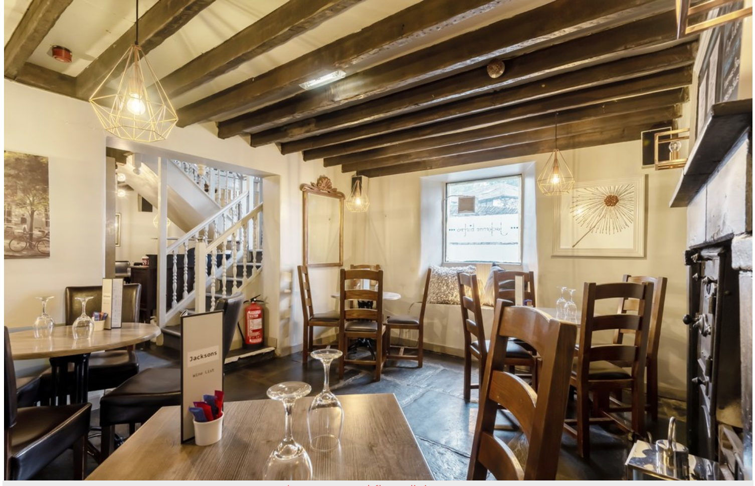
Lower ground floor dining area

Well Equipped Commercial Kitchen 19' 7" x 8' 0" (5.97m x 2.44m) with extensive stainless steel work surfaces and shelves, commercial 6 ring gas cooker, 2 microwaves, 3 fridges, freezers, grills, dishwasher etc. A full inventory will be prepared on sale.