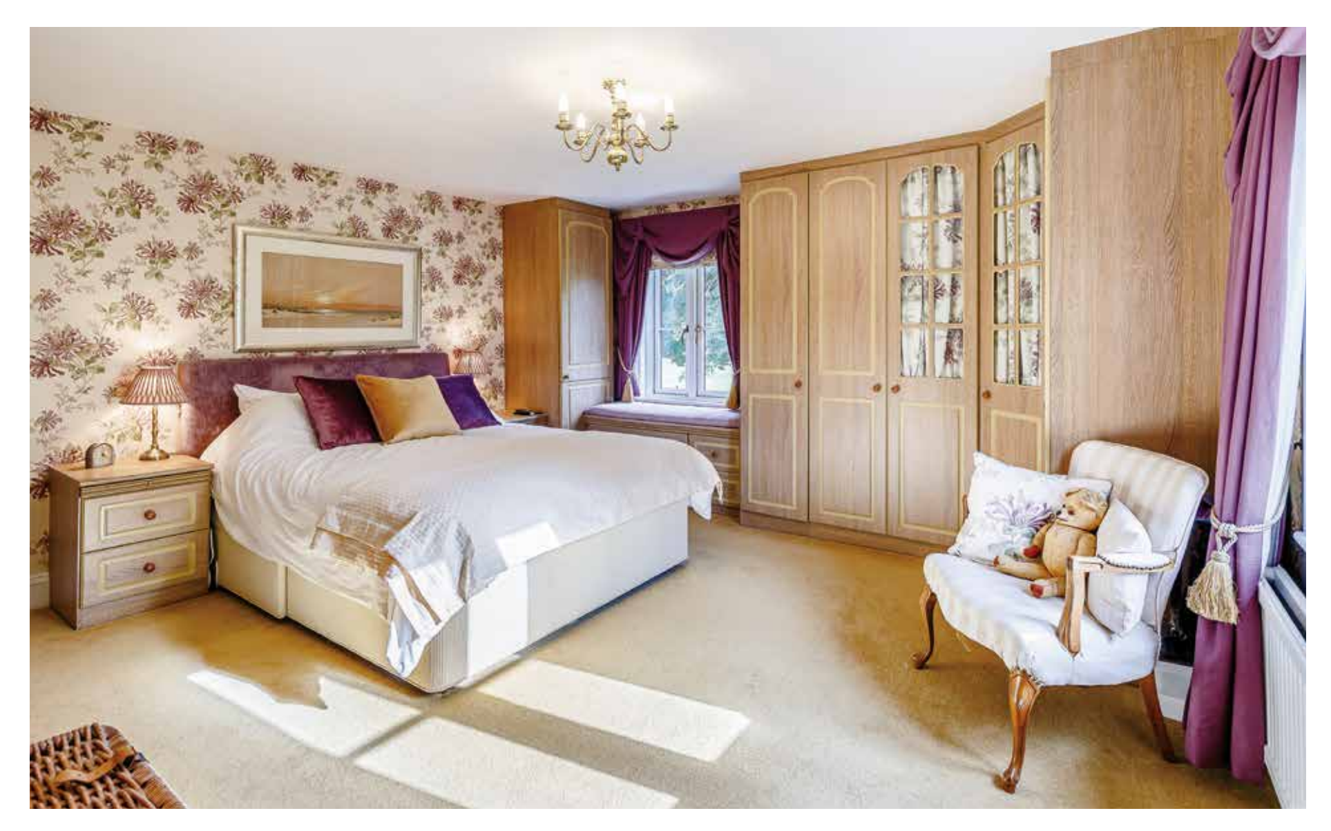
On the first floor you will find a fabulous master bedroom with fitted wardrobes and a window seat and an en suite bathroom/shower WC which includes a power shower. There are four further double bedrooms with fitted wardrobes and a family bathroom/shower WC which includes a power shower.