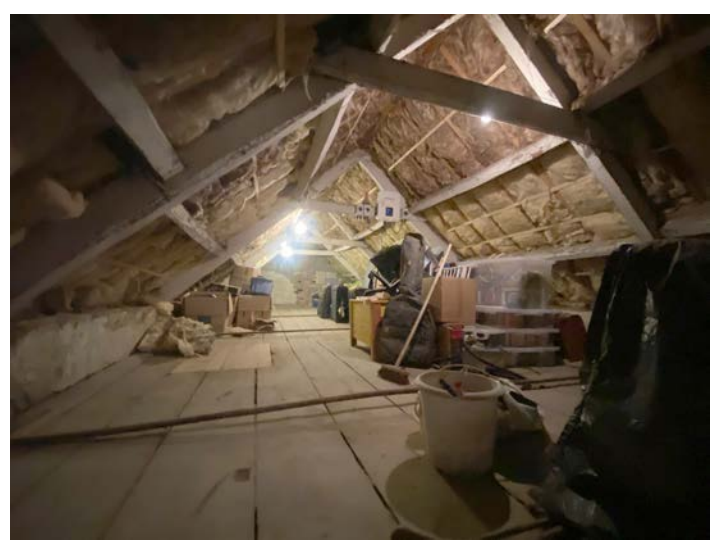
ATTIC TWO 37' 8" x 14' 4" (11.48m x 4.37m) Accessed via bedroom two.

37' 8" x 16' 1" (11.48m x 4.9m) Accessed via bedroom three. Access to solar panels.