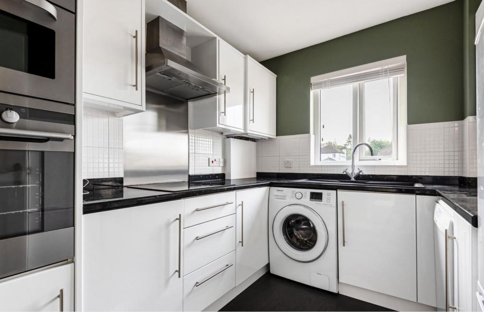
Modern Fitted Kitchen