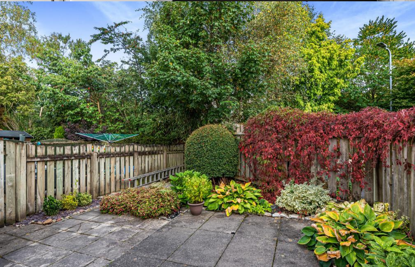
Shared Rear Garden