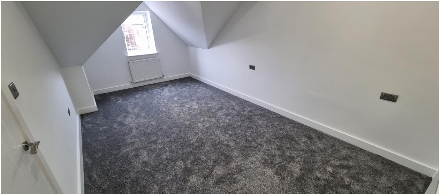
Bedroom one: 18'4 x 9'11