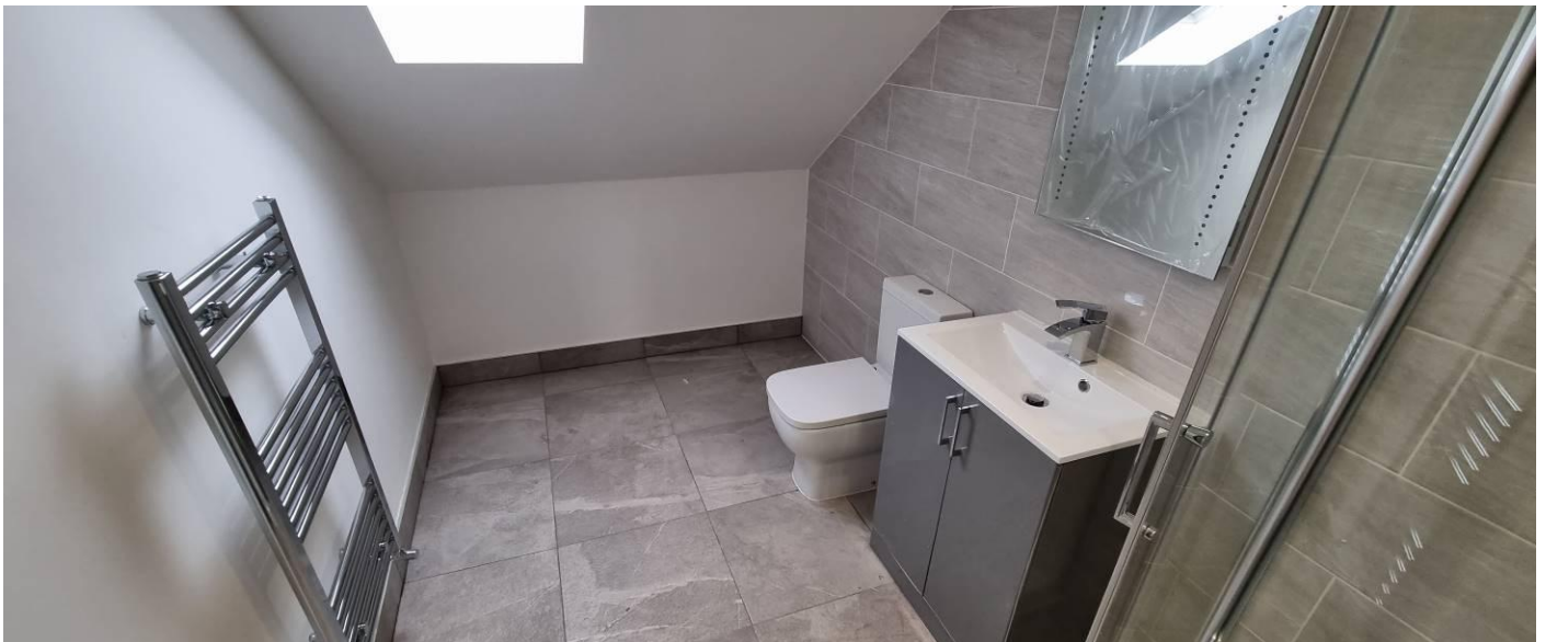
Ensuite: 10'7 x 5'11