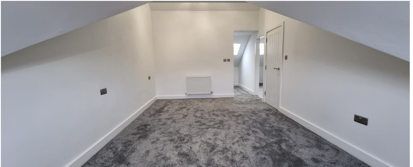
Dressing area: 8'3 x 10'3