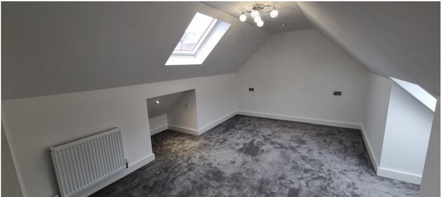
Bedroom one: 11'1 x 17'1