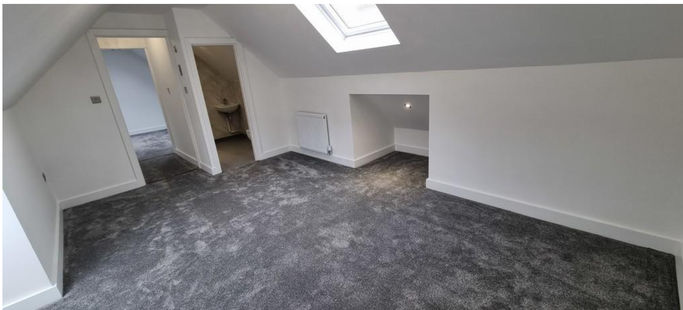
Ensuite: 4'5 x 6'6