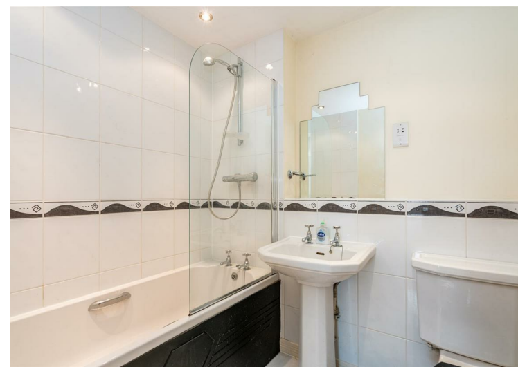
The Rex, High Street Berkhamsted