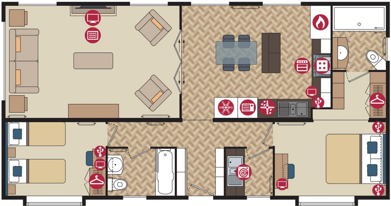
Lyndale Lodge 40ft x 20ft • 2 bedroom