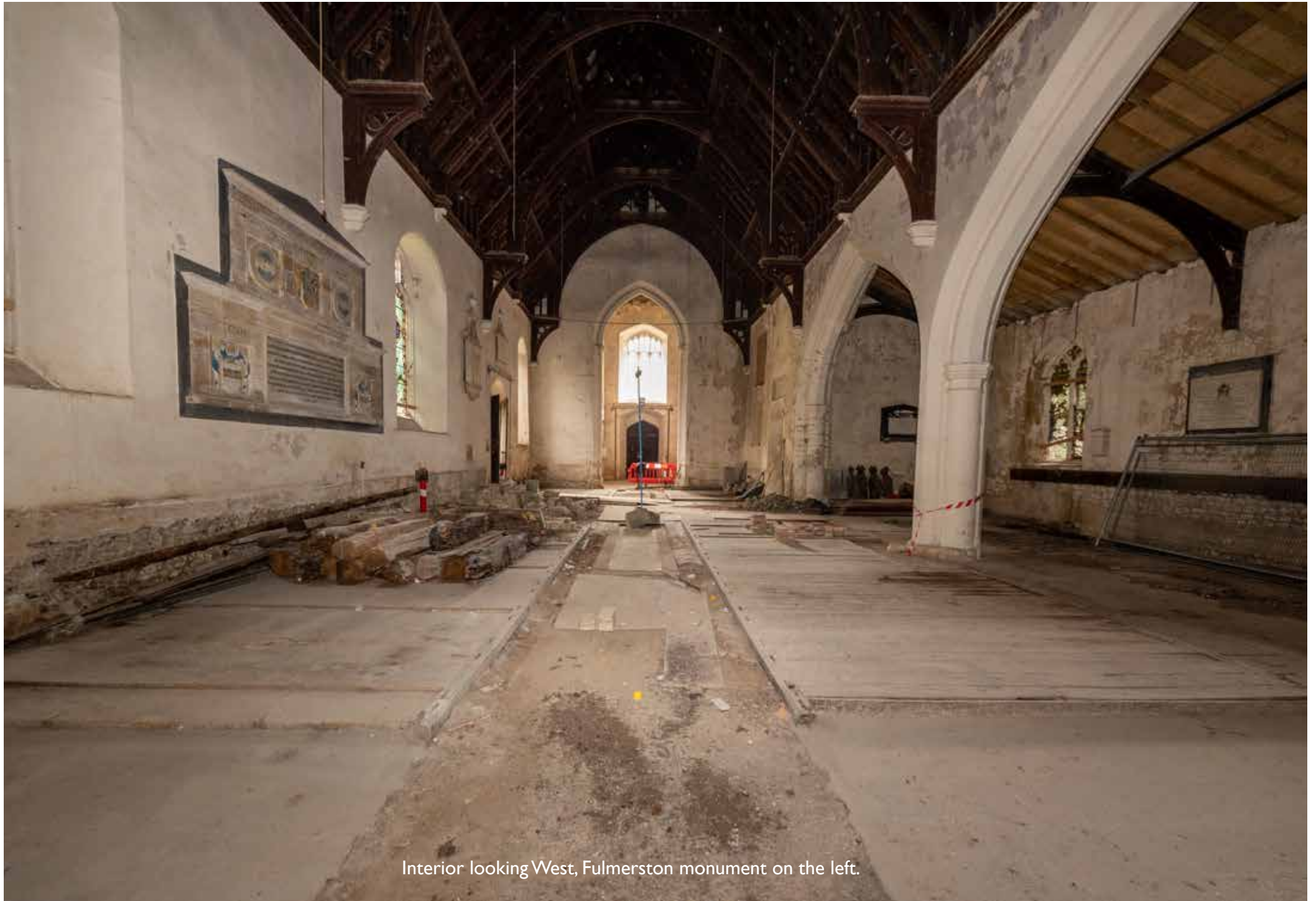
Interior looking West, Fulmerston monument on the left.