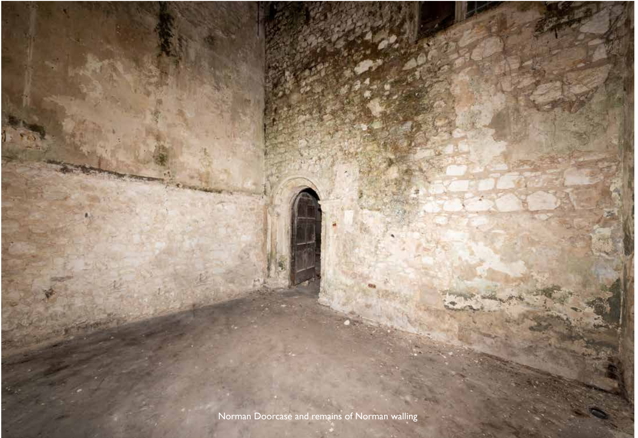
Norman Doorcase and remains of Norman walling