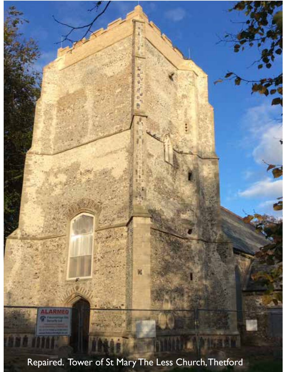
Repaired. Tower of St Mary The Less Church, Thetford