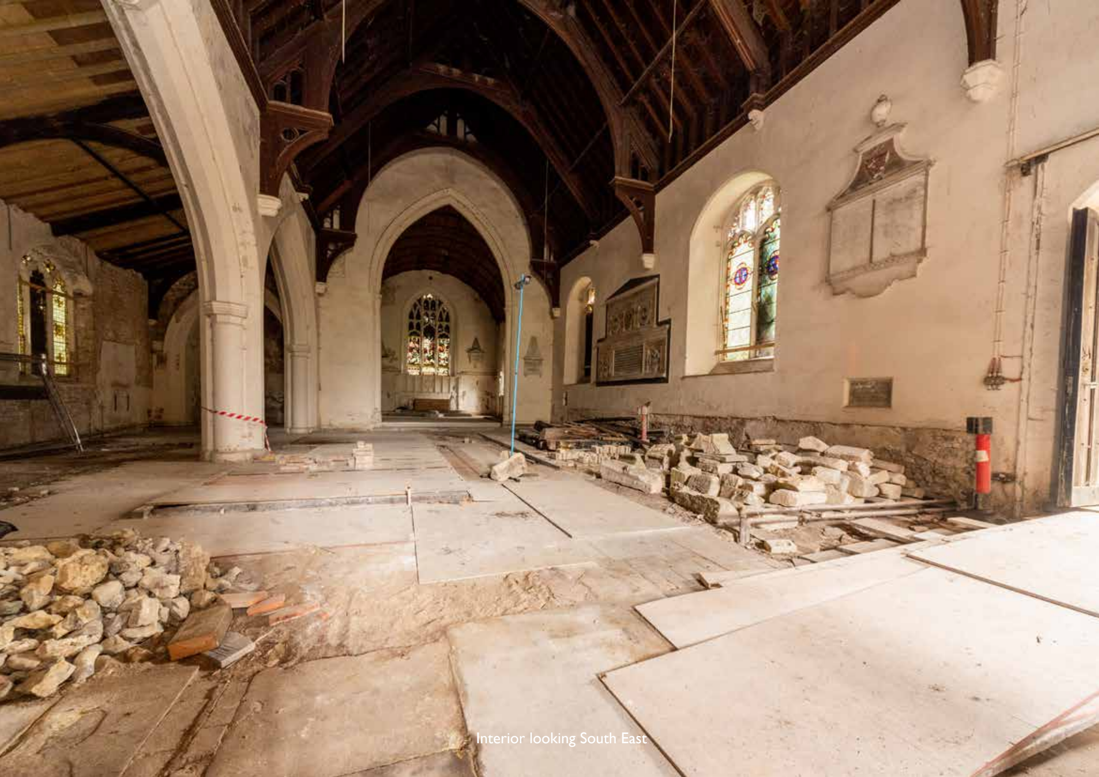
Interior looking South East