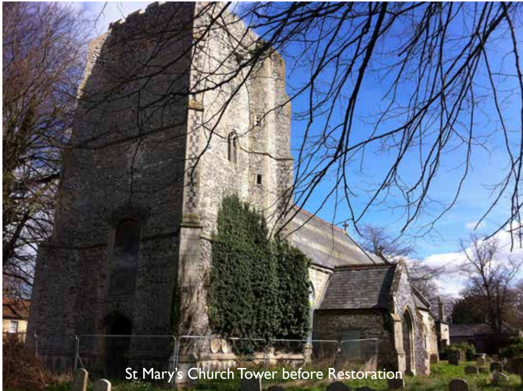
St Mary's Church Tower before Restoration