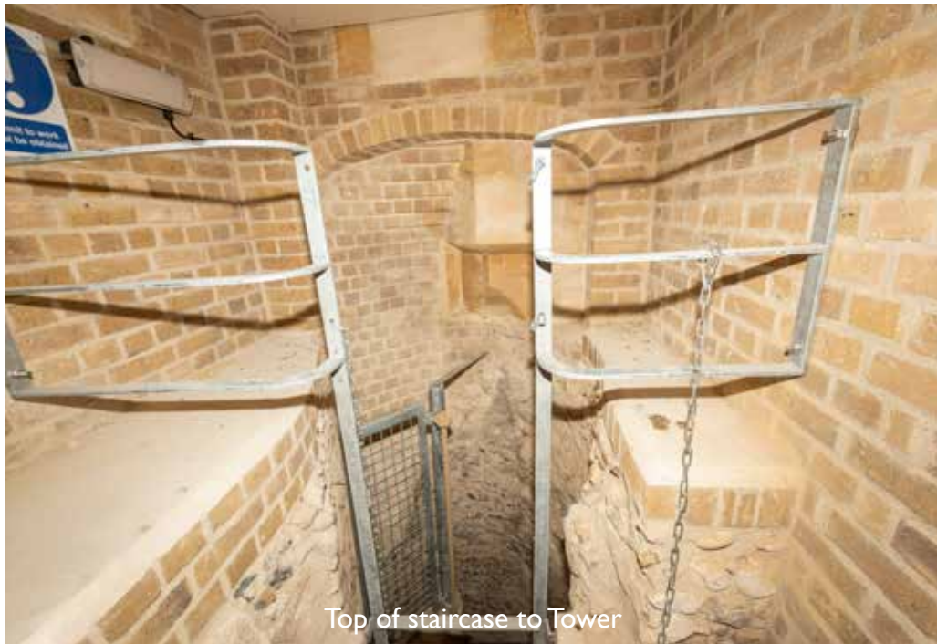
Top of staircase to Tower