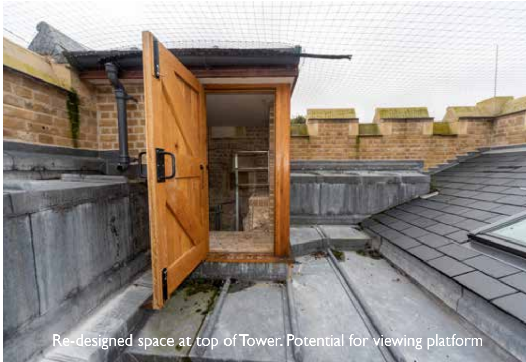
Re-designed space at top of Tower. Potential for viewing platform