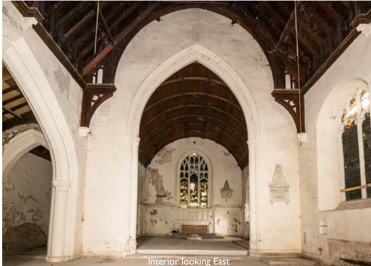
Interior looking East

This opportunity is not to be missed. This fabulous Grade II* listed redundant church has amazing potential for conversion to five units, subject to planning consents. Restoration to the tower has already been completed that attracted substantial grants from Historic England, but there is scope to carry the conversion further. The vendor is prepared to offer support to the purchaser with respect to obtaining the relevant approvals. Correspondence with Breckland Council available. Good relations with Historic England.