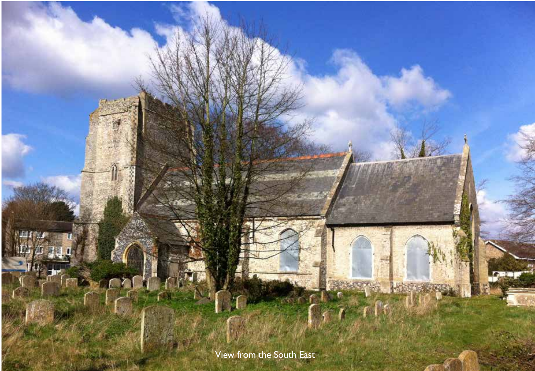
View from the South East

'Fabulous Renovation and Conversion Opportunity' St Mary The Less, Thetford, Norfolk | IP24 3AU