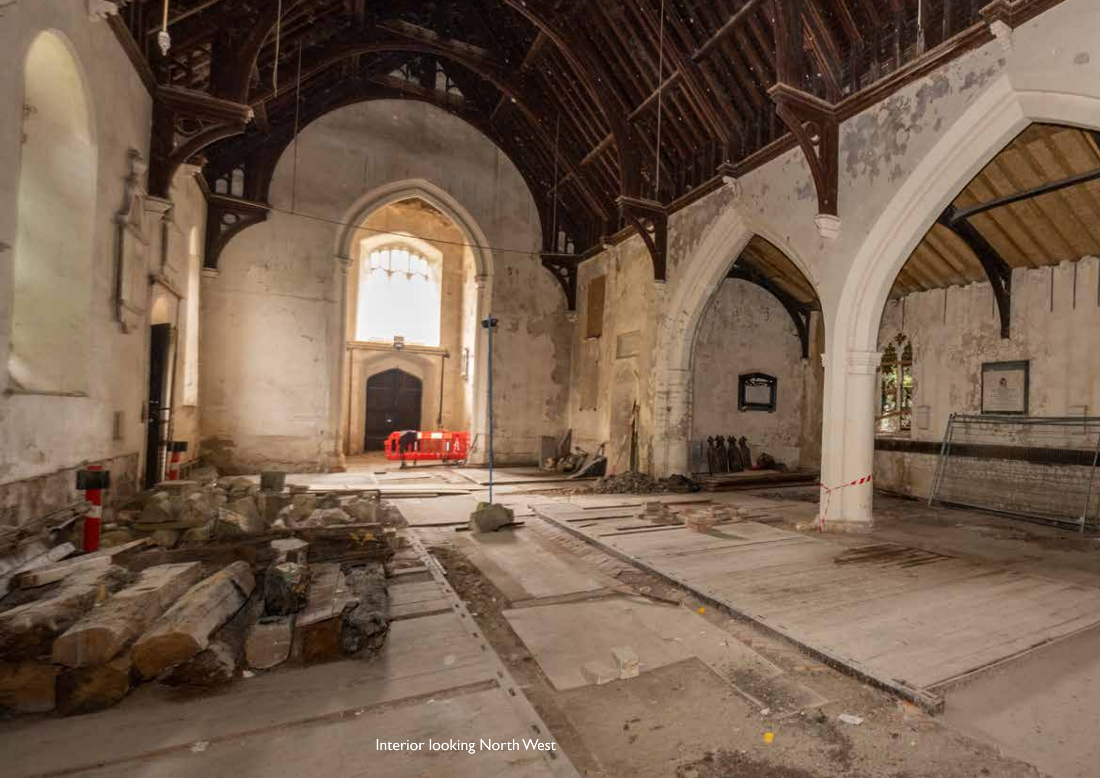
Interior looking North West