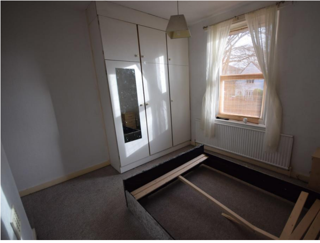
BEDROOM Carpeted flooring, wall mounted radiator, UPVC double glazed window built in wardrobes.