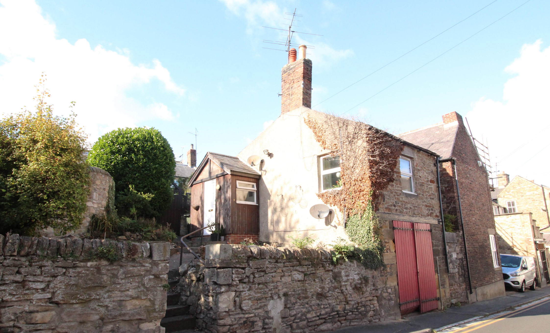
Vine Cottage, Eastgate, Hexham, Northumberland, NE46 1BH