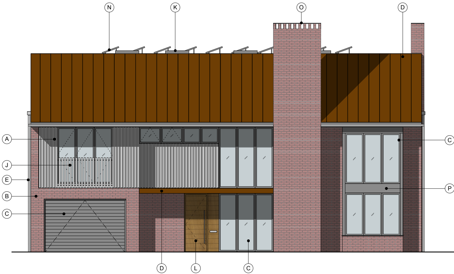
EAST ELEVATION - PROPOSED SCALE 1:100