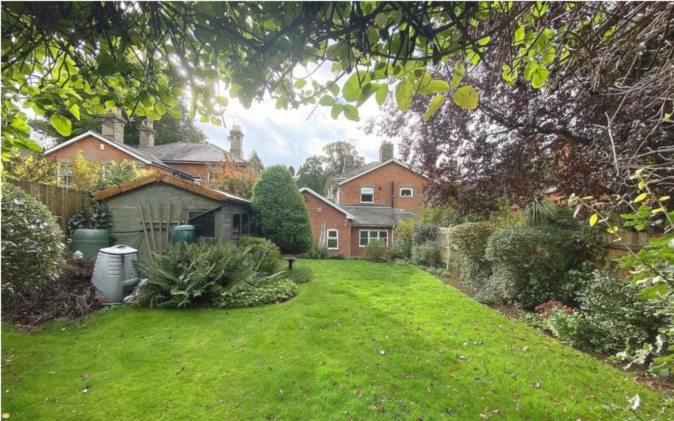
Particulars for 47a Graham Road, Ipswich, IP1 3QF