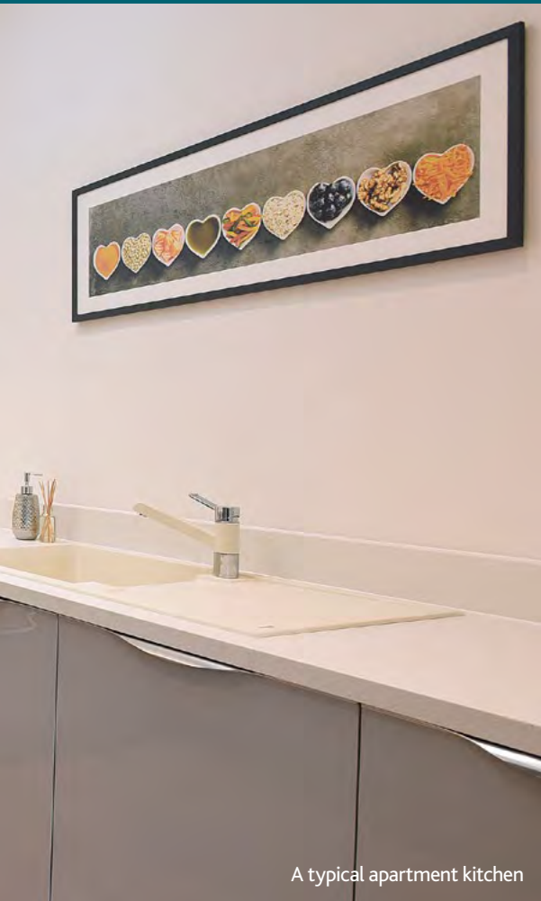
A typical apartment kitchen

All apartment living rooms have connection points for both satellite and terrestrial TV, radio, phone and broadband.