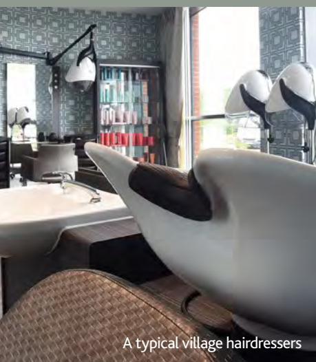
A typical village hairdressers

“Since moving here, I’ve not looked back. This is the future.”