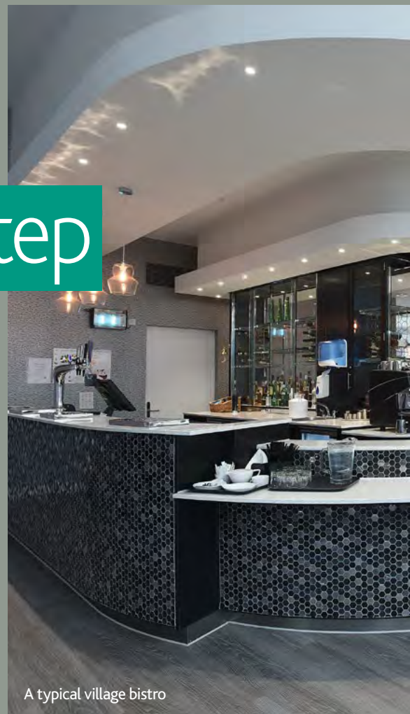
A typical village bistro

There is a dedicated games area, arts and crafts room, rooftop garden and greenhouse for residents to enjoy. You will never be far from a great choice of things to do.