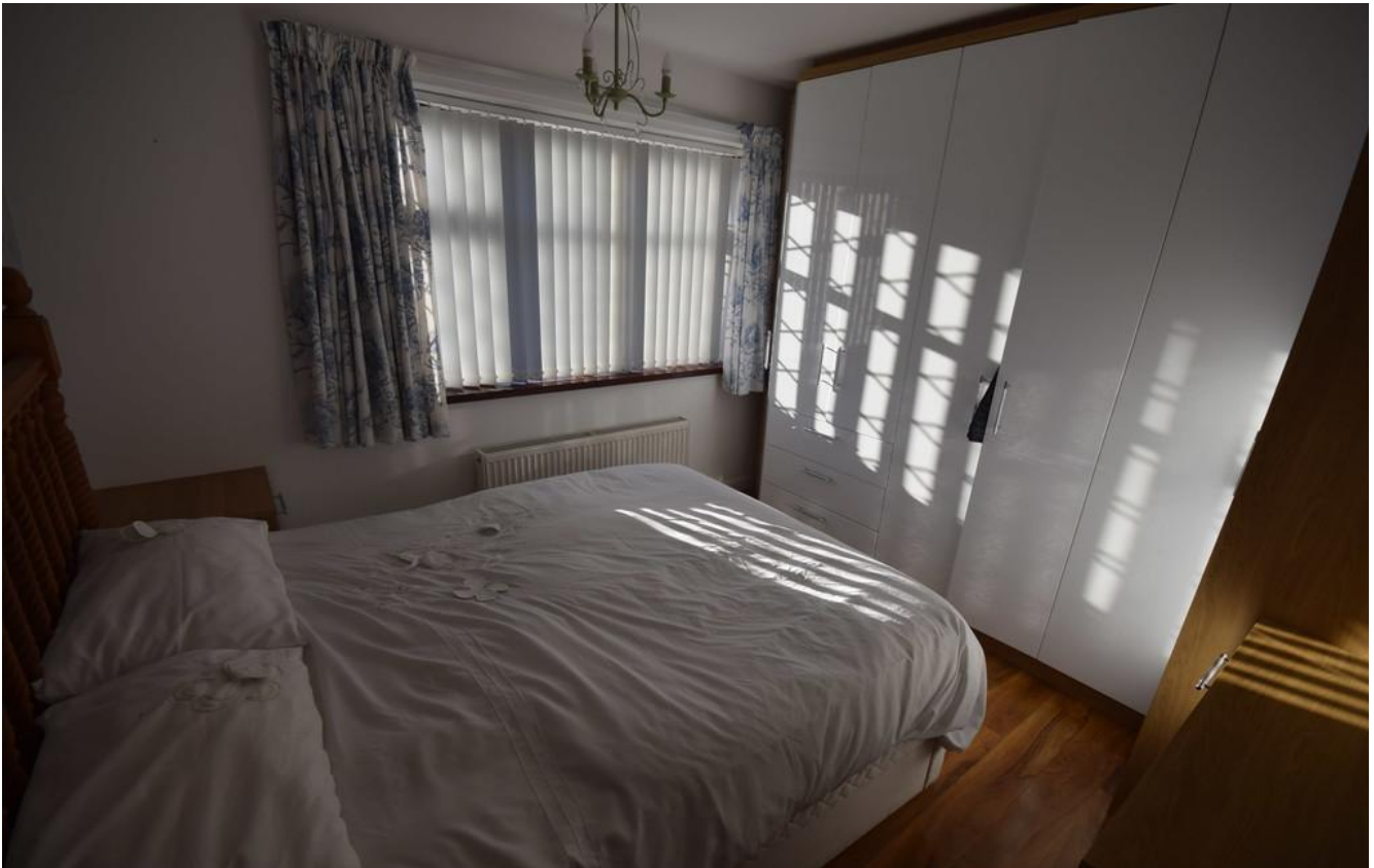
BEDROOM Fitted range of cupboards, window to front