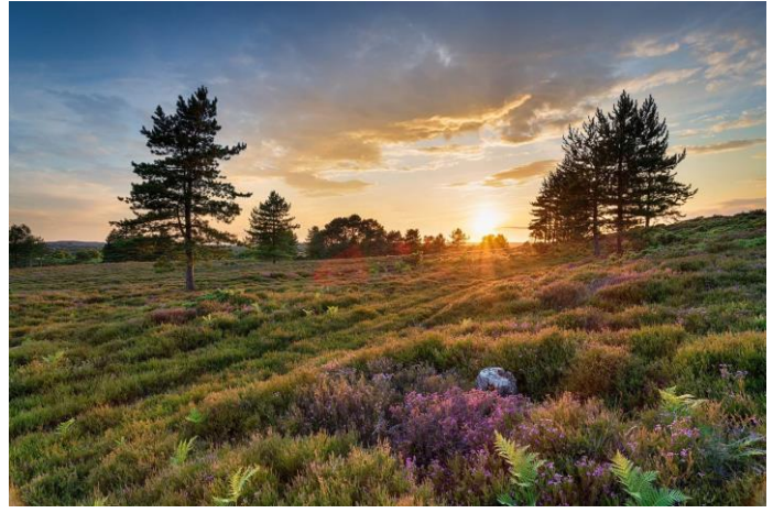
Please note: Stock images have been used, the home on site may vary.