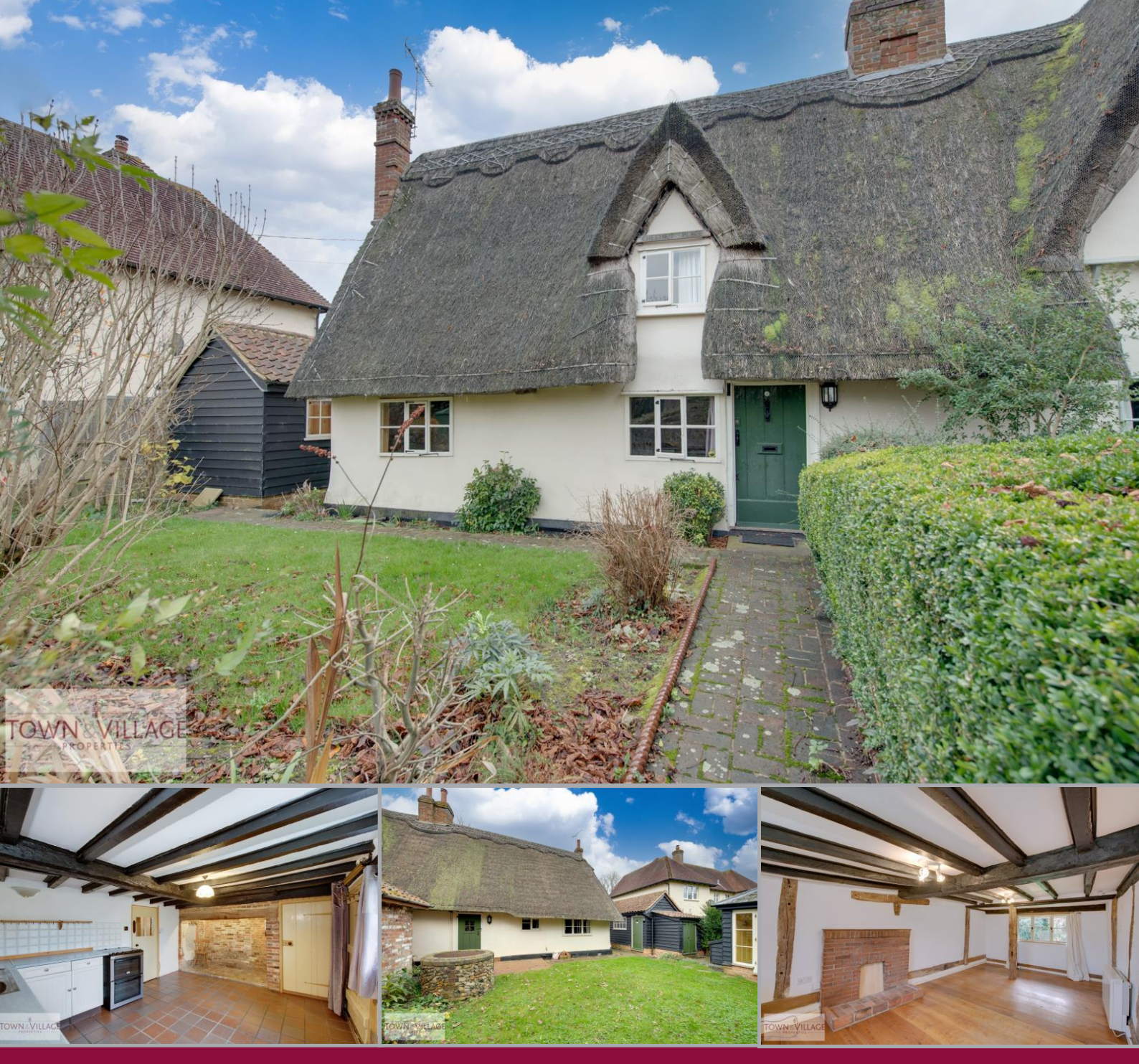
3 Chestnut Place | Gages Road | Belchamp St Paul | Sudbury | CO10 7BT

Specialist marketing for | Barns | Cottages | Period Properties | Executive Homes | Town Houses | Village Homes