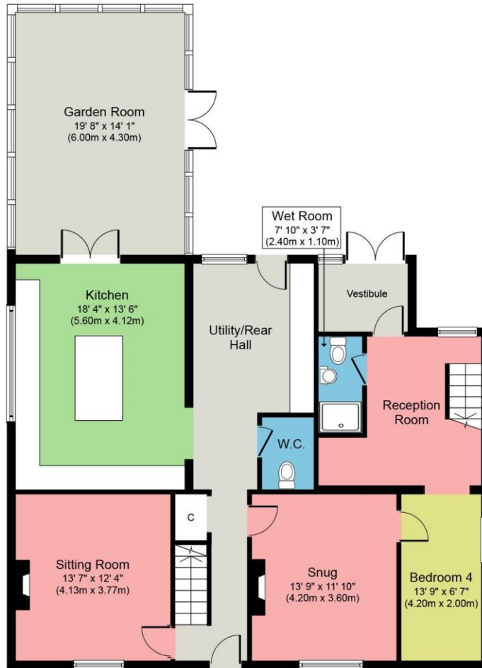
Ground Floor Approximate Floor Area 1,464 sq. ft. (136.0 sq. m.)