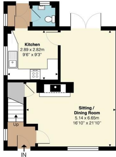
Ground Floor Approx Internal Area 488 sq ft (45.3 sq m)