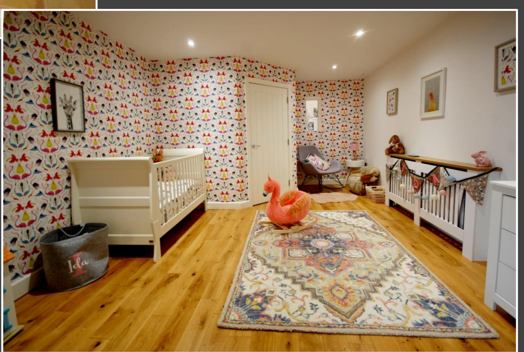
www.move with masons.co.uk