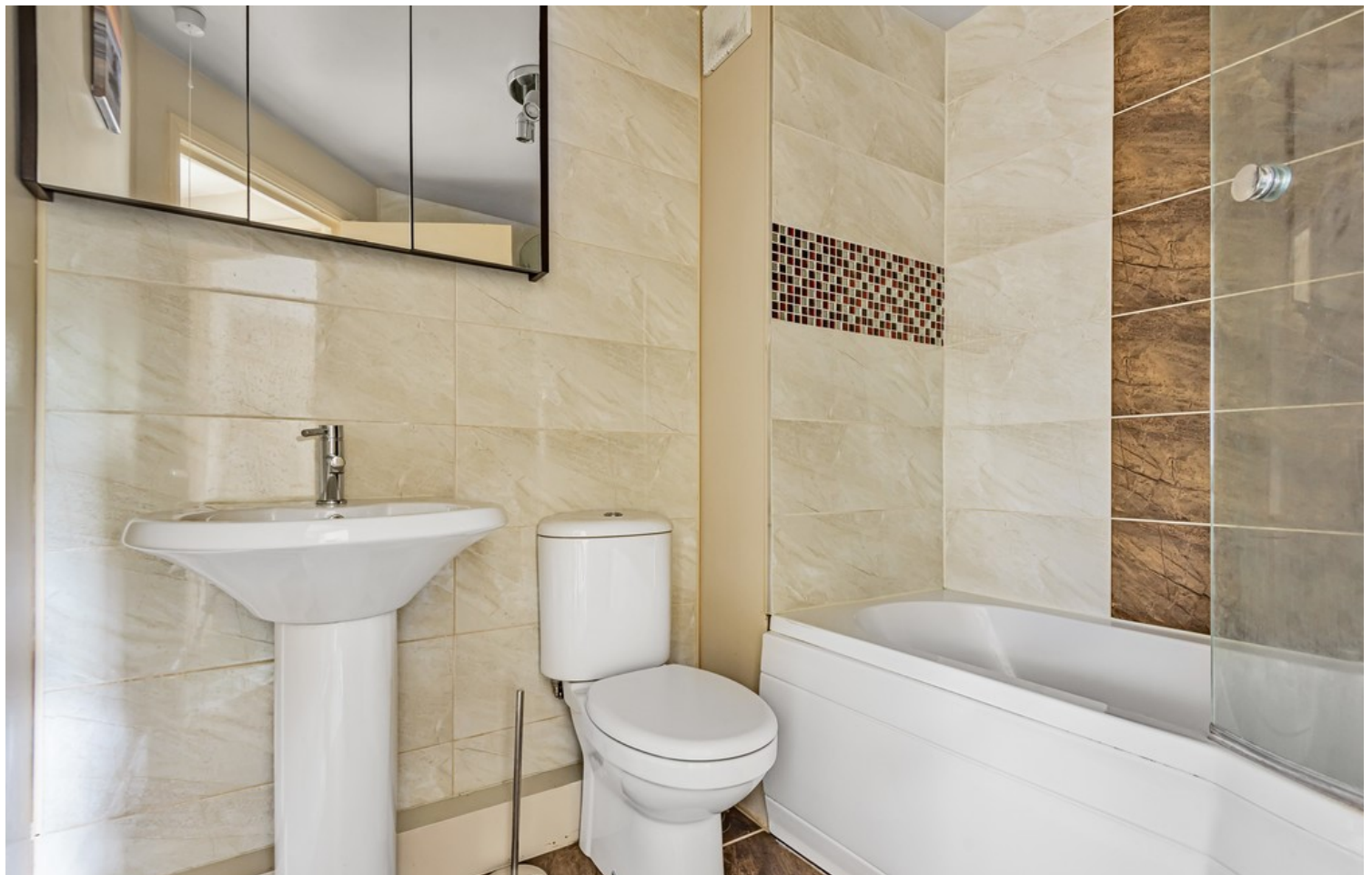
Modern Fitted Bathroom