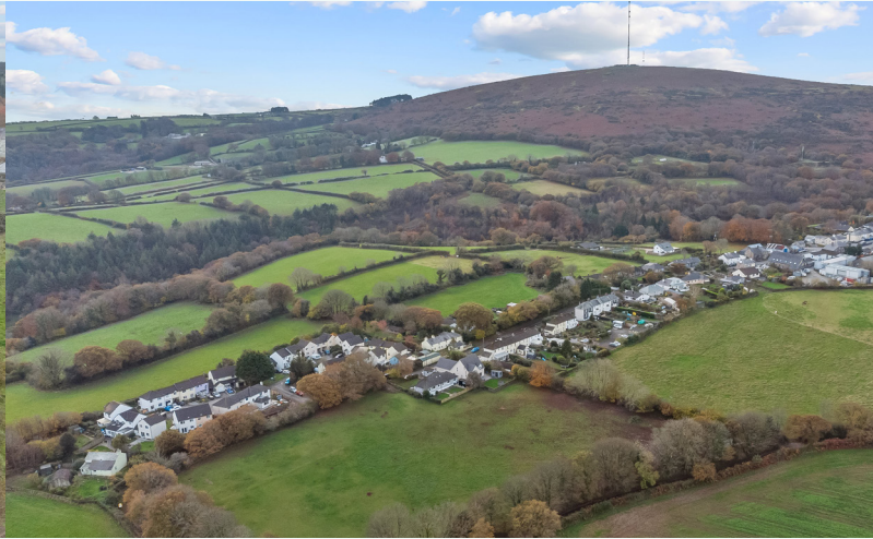
Site sits amongst beautiful countryside