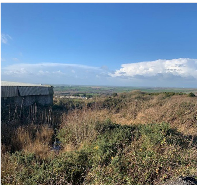
View from site