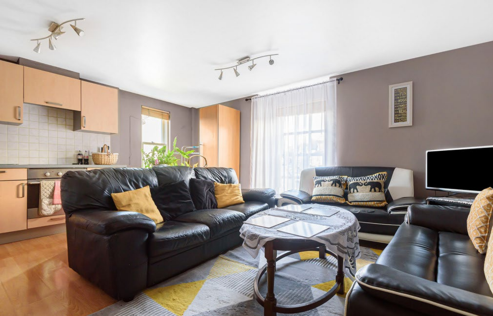
Open Plan Living/Kitchen