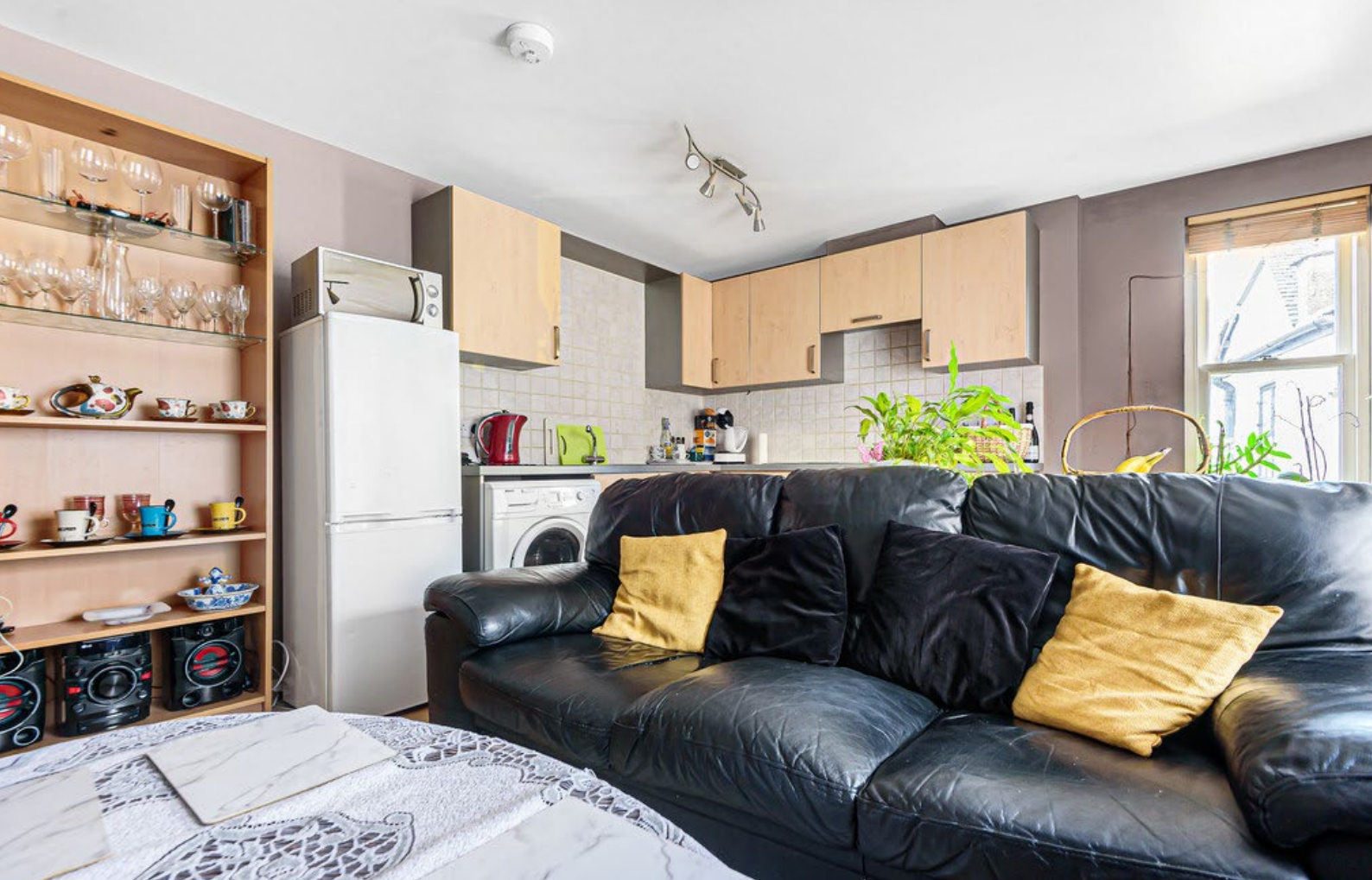
Open Plan Living/Kitchen

Bedroom 2 11' 6" x 7' 2" (3.51m x 2.18m) Wood effect laminate flooring.